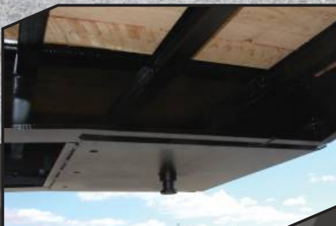
S.A.E. King Pin with smooth approach plate for easy hook-up.