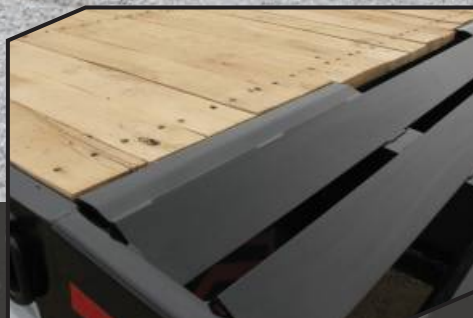
Wood protectors are standard on Big Tow B-series trailers and protect the end of the deck boards.