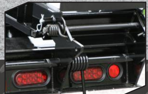
Two-way spring assist ramps allow you to easily lift ramps off deck and also off the ground. Grommet mounted LED lights are standard.