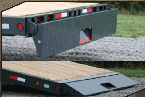
Patented automatic kick-out ramp doubles as under-ride protection.