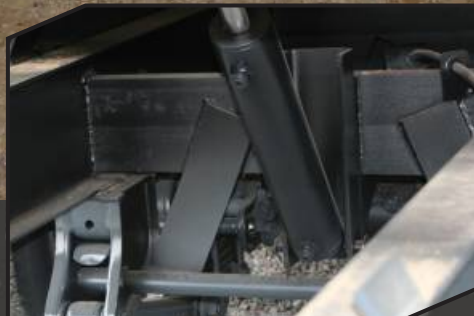
Cushion cylinder controls the deck from slamming when loading or unloading equipment.