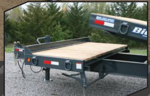
Standard 4-foot stationary deck gives room for longer equipment and makes towing easier.