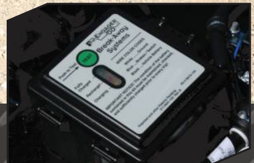
Sealed battery break-away system charges while plugged into the tow vehicle and can be checked at the press of a button.