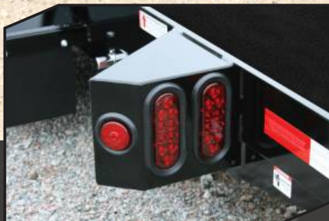
Grommet mounted LED lights are standard.