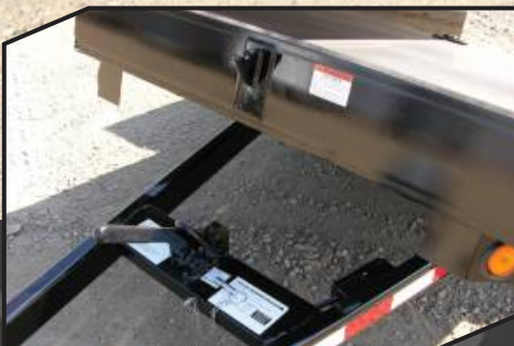
Positive locking (over-center) latch system keeps deck secured to the frame.