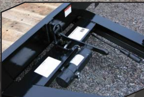
Positive locking (over-center) latch system keeps deck secured to the frame.