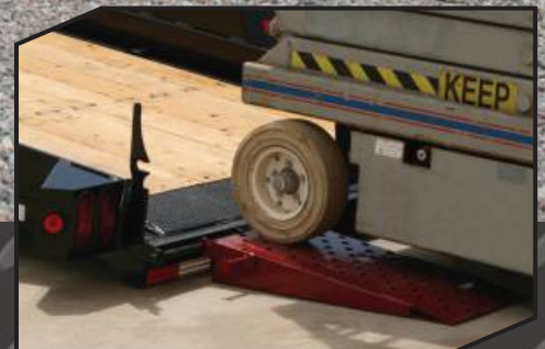
The "SL" (Scissor Lift) option includes ramps to lower the loading incline.