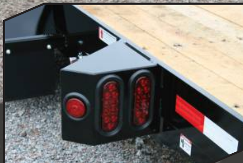
Grommet mounted LED lights are standard.