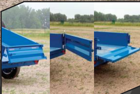
Tri-swing rear gate opens to the side, down from the top, or swings open from the bottom.