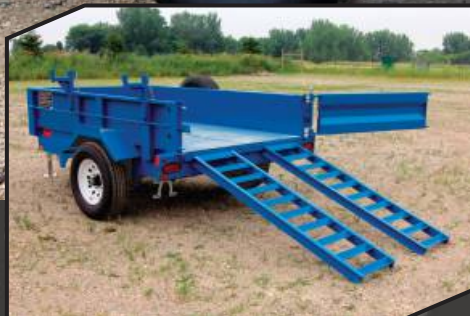
Optional ladder-style ramps for loading equipment, stored above fender.