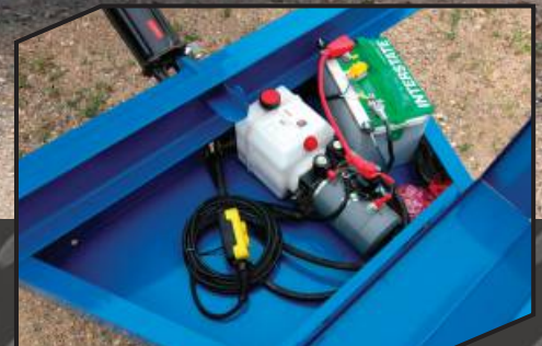
Built-in storage box houses hydraulic system with room for chains, straps or tools.