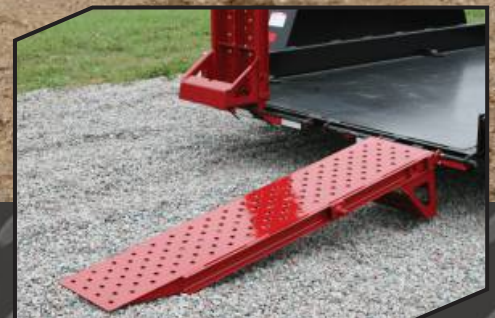
“SL” ramp option gives a lower load angle for special equipment like scissor lifts and other small-wheeled vehicles.