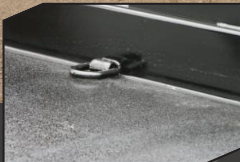
An optional steel deck with traction aid is available.