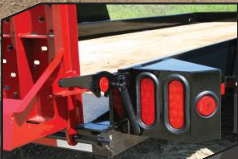
Patented Auto-Latch ® ramp hold-ups and LED lights are standard.