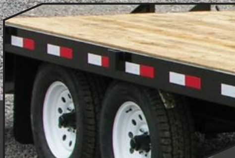
Stake pockets are standard on this model.