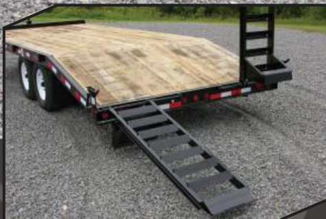
Wood topped beavertail and Auto-Latch ramp hold-ups.