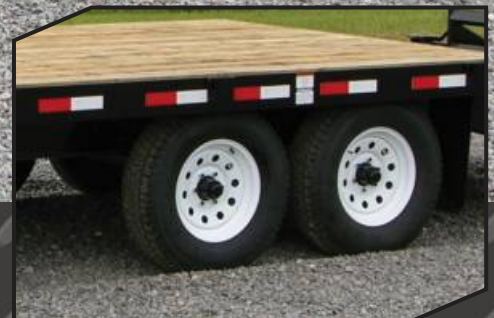
Rubber torsion axles provide a smooth ride.