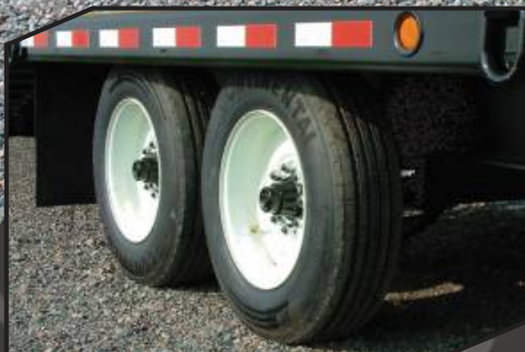
Single-wheel tandem axle. 8K axles with spring-ride suspension.