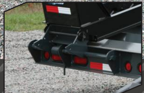
One-way spring-assist ramps and grommet mounted LED lights.