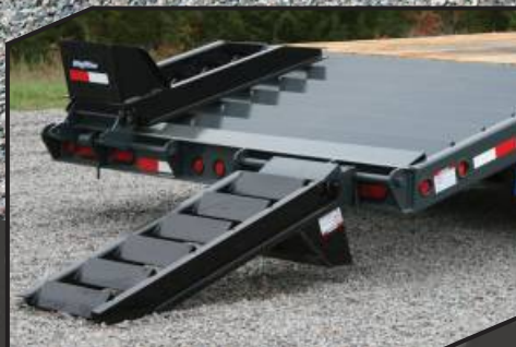
Angle-iron beavertail and ramps provide excellent traction for loading and unloading.