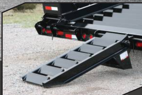
Angle-iron beavertail and ramps provide excellent traction for loading and unloading.