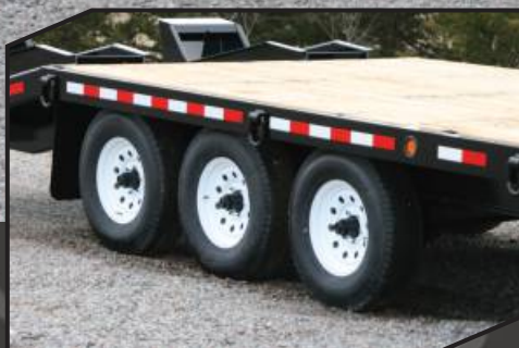
Single-wheel tri-axle. 6K axles with spring-ride suspension.