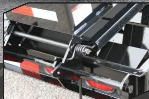
One-way spring-assist ramps and grommet mounted LED lights.