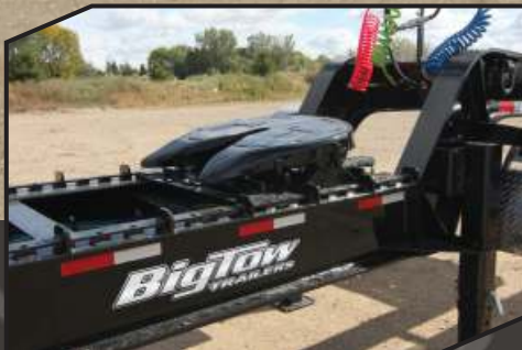
41" sliding adjustable fifth wheel.