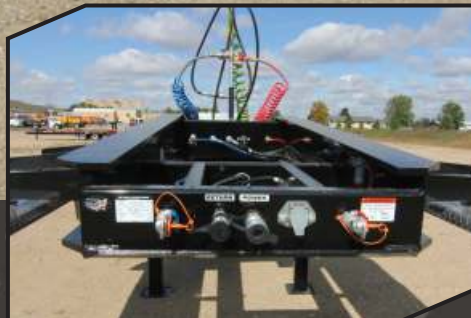
Heavy-duty main frame with conveniently located air and electrical connectors.