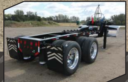
Air ride suspension.