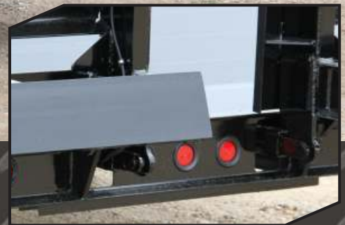
Ramp control levers through tailboard.