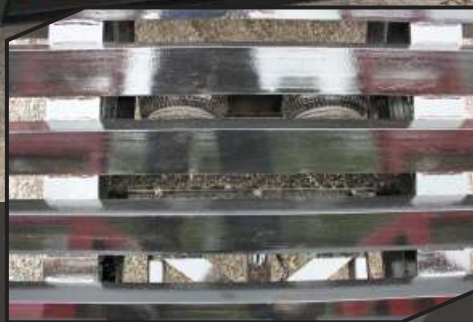
Air actuators located under beavertail.