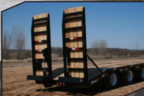
Solid-bar ramp holdups.