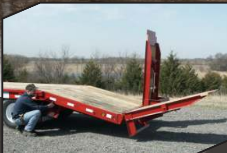
Easy to operate controls.