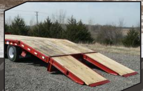
Wood-topped or steel cleat.