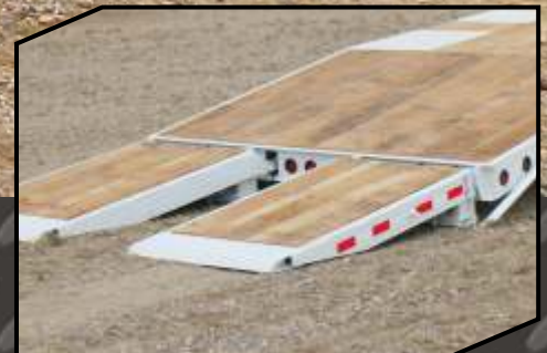
Optional 6-foot air ramps provide an easy approach angle.