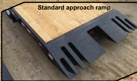
Standard approach ramp