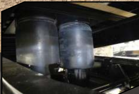
Dual air-bag design uses air from the tow vehicle's system.