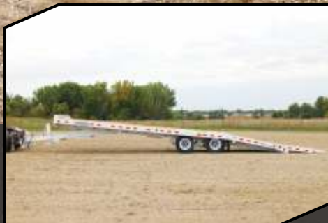
Low incline makes loading and unloading small-wheeled equipment easier.