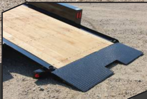
Long approach ramp allows easy equipment loading and unloading.