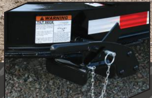
Single deck latch lever with dual latch securement is easy to operate.