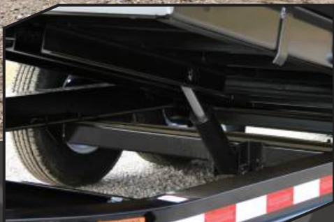
Cushion cylinder controls the deck when loading or unloading equipment.