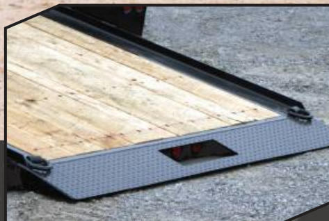
Knife edge approach ramp allows easy equipment loading and unloading.