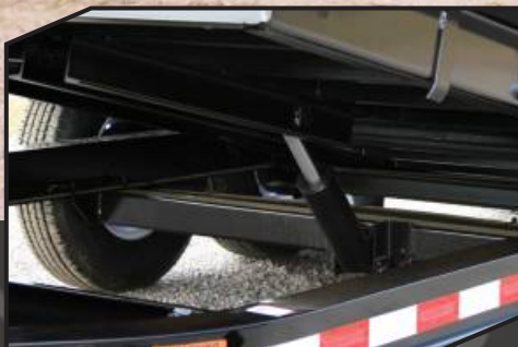
Cushion cylinder controls the deck when loading or unloading equipment.